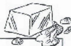
Ice Melt Data Chart